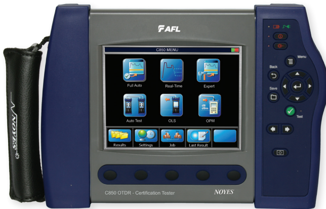
C850 Compact QUAD OTDR