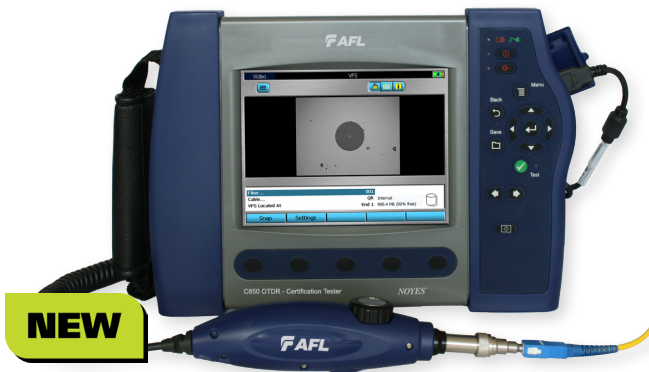
C850 OTDR with DFS1 Digital FiberScope