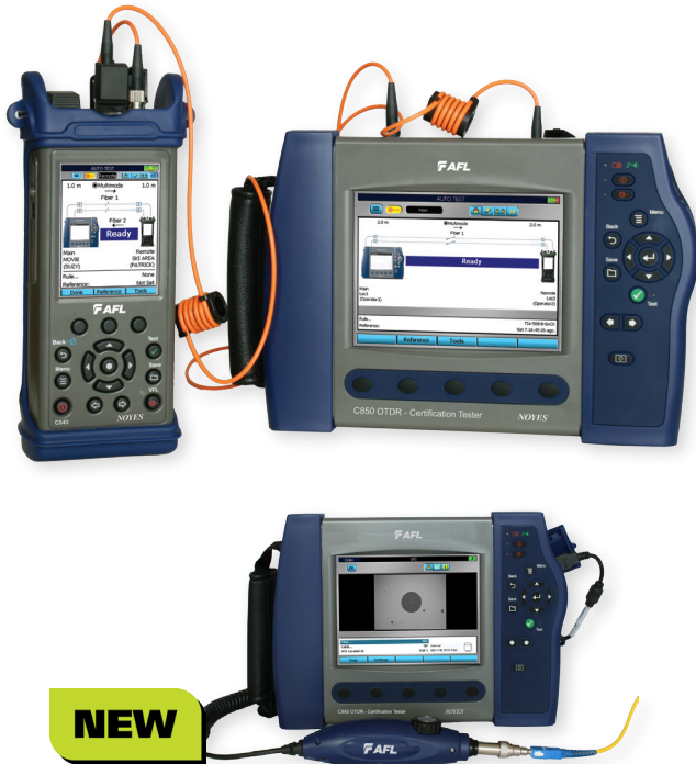
C860 with DFS1 Digital FiberScope